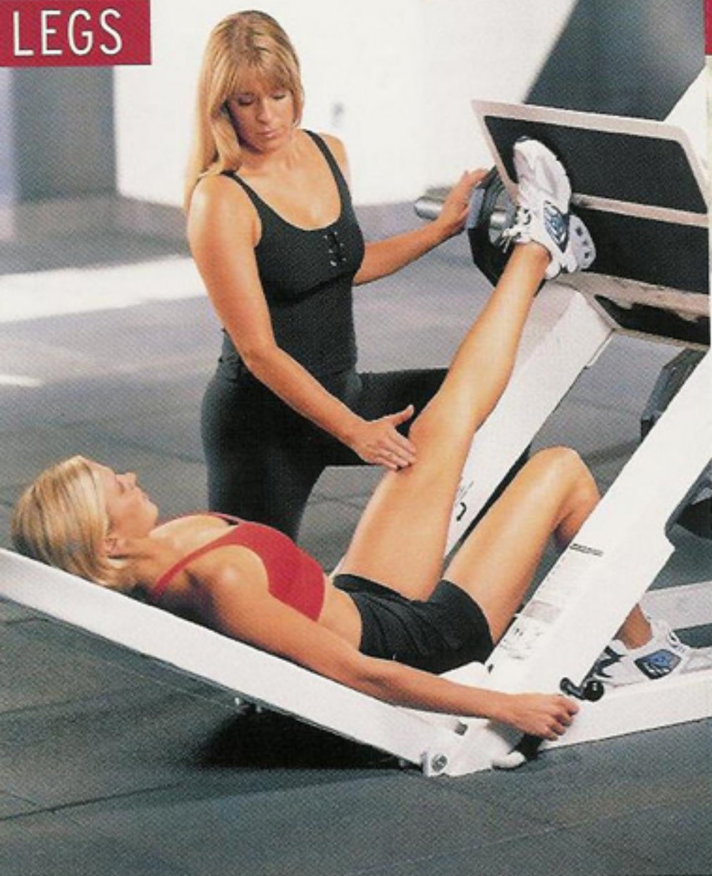
take it to the gym one-legged press